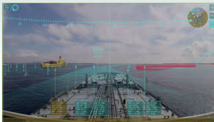
※AR navigation is an auxiliary tool designed to improve the navigation comfort for safer navigation. In no case should AR navigation replace Radar, ECDIS etc. and other required instruments for danger avoidance.

The unique graphic user interface of AR Navigation System reduces workload and stress from watch duties, while intuitive readings help contribute to safety of navigation by enhancing situational awareness.