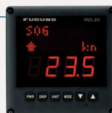
Model: RD-20 (144mm x 144mm)

The RD-20/RD-50 display data from onboard sensors. The displays are switched by a remote controller and display brilliance of all units can be centrally controlled from one dimmer unit.