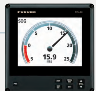
Model: RD-50 (240mm x 240mm)