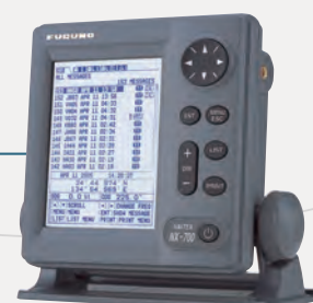
Model: NX-700B (display only)