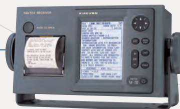
Model: NX-700A (display with a printer)

The NX-700 can receive the NAVTEX messages on 518 kHz and 490 kHz or 4209.5 kHz at the same time.